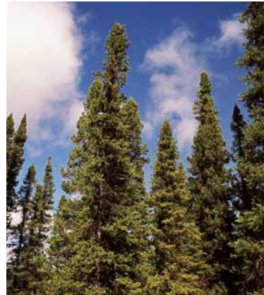
Boreal forest in Labrador

Boreal conservation contributes not only to reducing the rate of climate change (i.e., mitigation) but also to minimizing its adverse effects (i.e., adaptation). The unprecedented rate of climate change expected in northern regions has profound implications. Anticipated impacts are diverse and include rapid northward shifting of habitat, increased fire and insect outbreaks, altered phenology, and degraded aquatic systems. Fortunately, Canada's Boreal Forest is better suited than most to withstand such changes due to its intactness. Intact ecosystems will help buffer species from a changing climate, while also permitting species migrations needed to track shifting habitat. Canada's Boreal Forest is already a haven for species that have been extirpated from more southern areas, and this role will only increase in the future as species are pushed north by climate change.